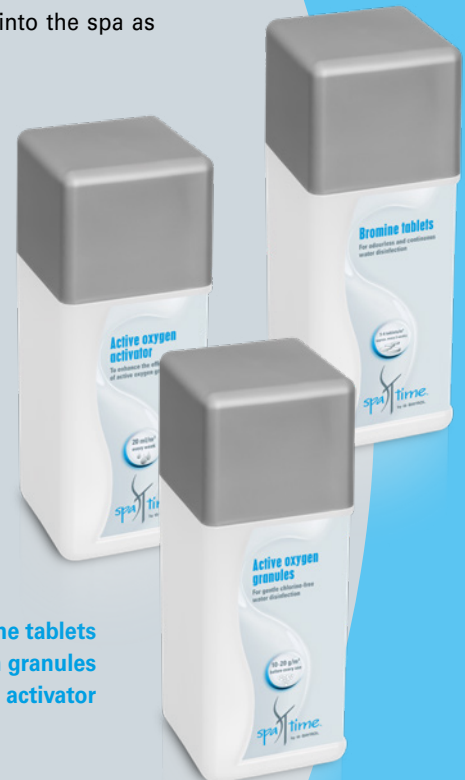
Bromine tablets Active oxygen granules Active oxygen activator

To increase the effectiveness of the granules, use them together with the Active oxygen activator .