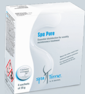
Spa Pure Box with 4 35 g sachets

This product can be used with all three care methods (chlorine, without chlorine using active oxygen or bromine).